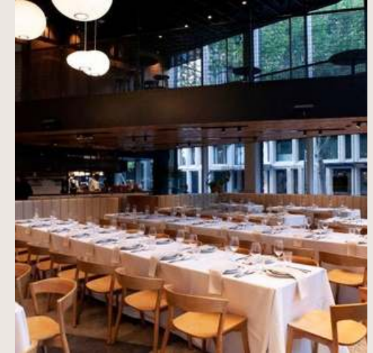
Square One Rialto is available to exclusive hire for evening events Monday-Saturday and all day Sunday. We can accommodate 190 standing or 80 seated.