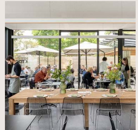
The Heide Kitchen and Sidney Myer Education Centre are open for exclusive bookings for workshops, private events, and weddings. Guests are encouraged to discover the grounds and museum while enjoying our welcoming hospitality.