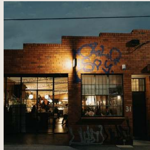
Discover the quaint and inviting Lilac Wine nestled in the industrial streets of Cremorne. This unassuming wine bar offers large group bookings and exclusive venue hire options for up to 70 people seated or 110 standing.