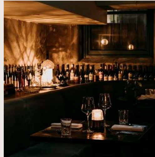
Dessous is situated in the city center at 164 Flinders Lane, Dessous is a wine bar and restaurant nestled in the basement of the historic Richard Allen & Son building. We can host up to 60 guests for a seated event or 80 for a standing reception.