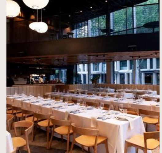
Square One Rialto is available to exclusive hire for evening events Monday-Saturday and all day Sunday. We can accommodate 190 standing or 80 seated.