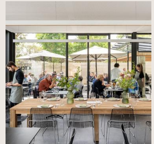
The Heide Kitchen and Sidney Myer Education Centre are open for exclusive bookings for workshops, private events, and weddings. Guests are encouraged to discover the grounds and museum while enjoying our welcoming hospitality.