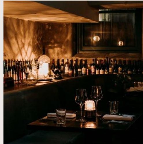
Dessous is situated in the city center at 164 Flinders Lane, Dessous is a wine bar and restaurant nestled in the basement of the historic Richard Allen & Son building. We can host up to 60 guests for a seated event or 80 for a standing reception.